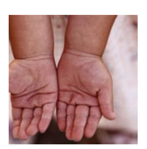
Strengthening Families. Restoring Futures.