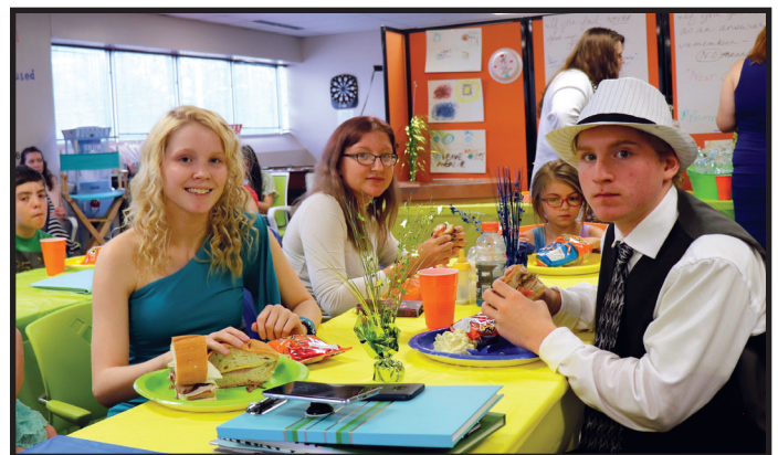
Graduation day is a happy occasion for clients and their families.