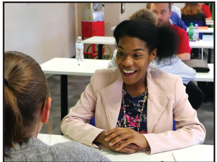
After creating resumes, youth participate in mock job interviews led by local employers.