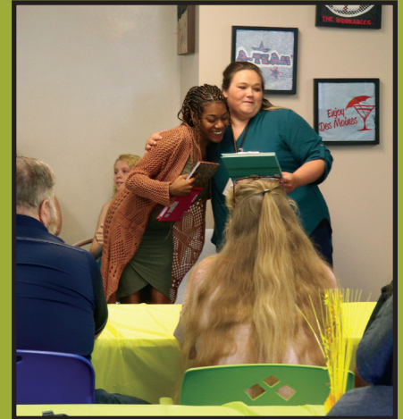
Pure joy at one of CFI's work readiness program's graduations.

*Name has been changed to protect client confidentiality.