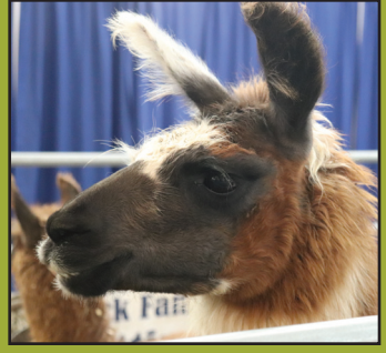
Farm animals like this llama were popular with the children on Saturday. The Petting Zoo was provided by Hovick Family Farms.