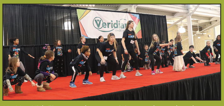
Hy-Vee KidsFit stage show participants danced and exercised to popular music.