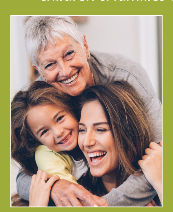
Restoring hope . Building futures . Changing lives .