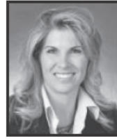
Karen Goldsworth Strauss Security Solutions