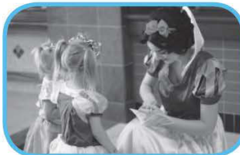
Snow Whites get to know each other.