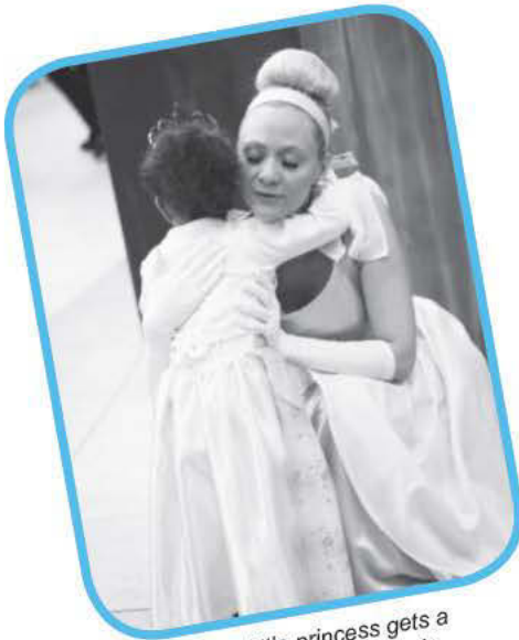
A little princess gets a hug from Cinderella.