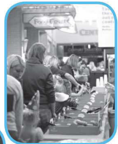
A feast fit for princesses!